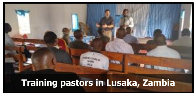
Training pastors in Lusaka, Zambia

teaching pervasive in the church, the government is moving toward passing a law requiring all pastors nationwide to show proof of some formal training. This means that over 90% of churches will be forced to close their doors! But he said our training is the perfect solution , and he is eager to work with us in forming a plan to take Pathways Bible Training throughout the country. To learn more about this work, CLICK HERE .