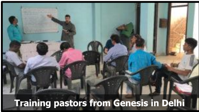
Training pastors from Genesis in Delhi