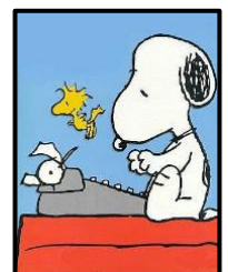
Never-ending dissertation work

May – Brazil. This month, I was in Brazil conducting dissertation research interviews and training pastors in the south. It was a very productive, encouraging time hearing how Pathways principles have been implemented in lives and ministries of pastors. I'm also gathering valuable information on how pastors in the Global South learn, where they struggle, and how we can best help them. To read more, CLICK HERE .