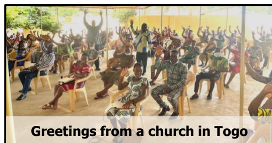
Greetings from a church in Togo