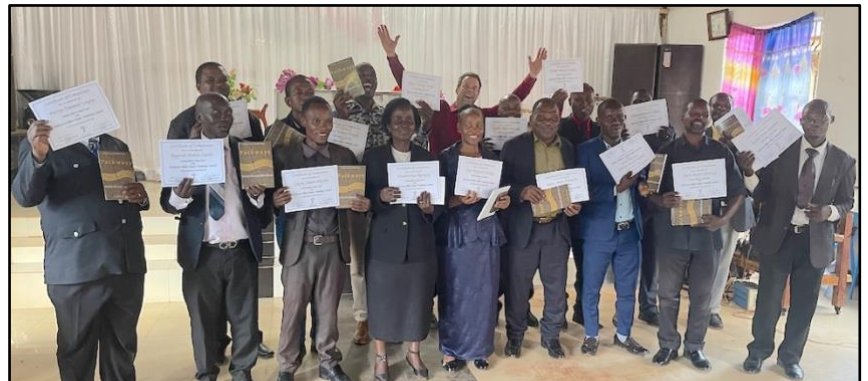
Graduation in Muheza, northern Tanzania

Paul's final words to the Ephesian elders provide a fitting doxology for you, our dear ministry partners: "I commend you to God and to the word of his grace, which is able to build you up and to give you the inheritance among all those who are sanctified." -Acts 20:32