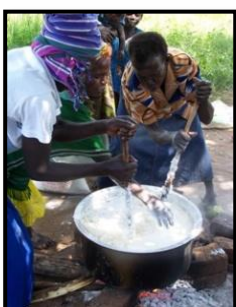
Women cooking ugali, the primary food of much of Africa.