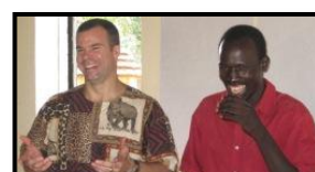
Training is FUN!