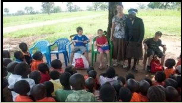
Leading children's program in Uganda