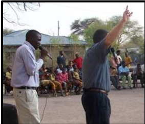
Preaching at open air crusade in Shinyanga. More souls entered the Kingdom, praise God!

The conference I led last September for a cluster of 30 Baptist churches in the Shinyanga region of Northwest Tanzania has certainly borne fruit. They have made a commitment to send three of their leaders to Dar twice each year and receive training with the local Baptist pastors, and then return to their home villages and teach it to the other pastors. "Develop, Empower, Release!"