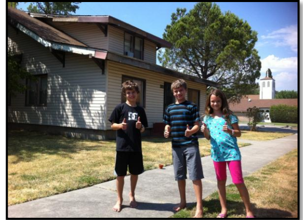
Kids in front of our Richvale home (left) and church (right)