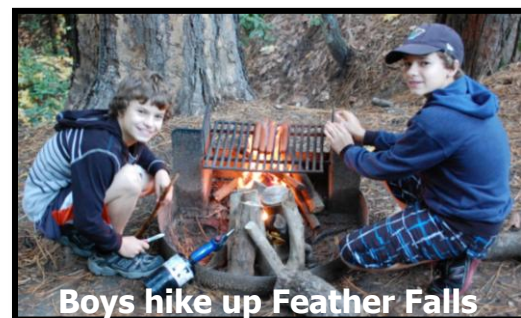
Boys hike up Feather Falls

Therefore, in consultation with ReachGlobal leadership, we have decided we need to remain in America for the next several months , and we have high hopes that by early summer the family will be ready to return to Dar (if God wills). Please join us in praying to this end. This also works well with