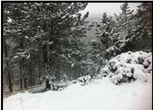
Snowstorm in Colorado

Recent Events. Early in April, I made a trip to Colorado to meet with a large group of pastors and make connections toward developing a group of global equippers . It was also a joy to be with dear friends and a supporting church. Despite a snowstorm that threatened to strand me in Salt Lake City, it was a very beneficial time. Curriculum development and ongoing coaching of African pastors have been keeping me quite busy.